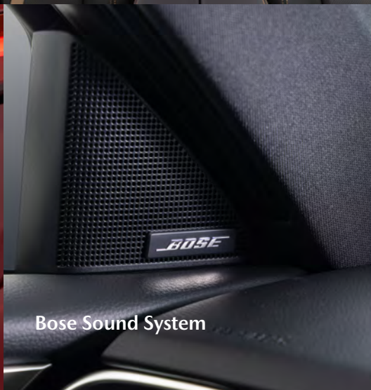
Bose Sound System