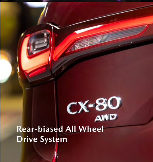
Rear-biased All Wheel Drive System