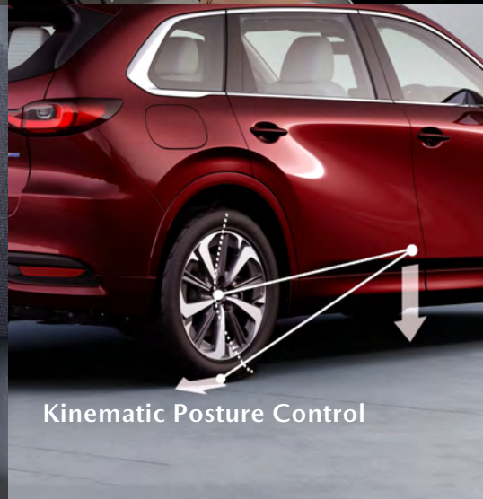
Kinematic Posture Control