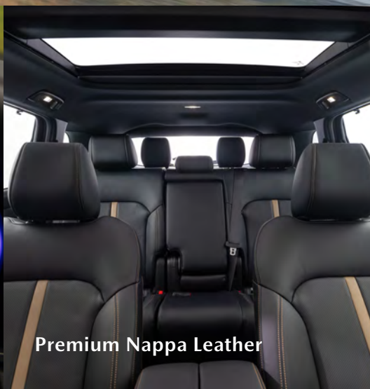
Premium Nappa Leather