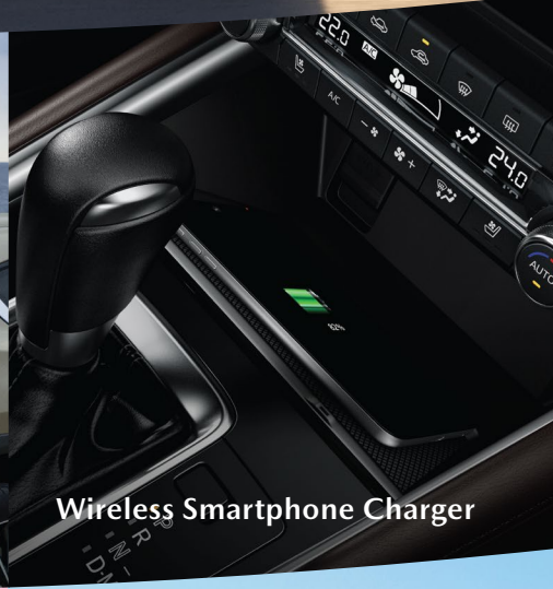
Wireless Smartphone Charger