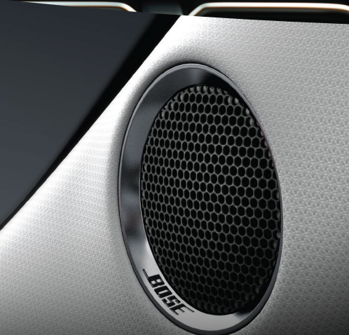
Bose Sound System