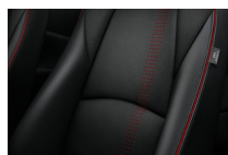
Leather + Fabric, Black